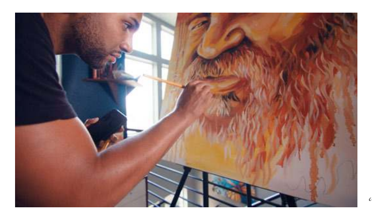
VIDEO "We Are All Poor"