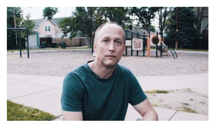
VIDEO "Creating Options Together"