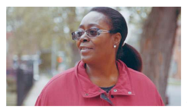
VIDEO "Who Is My Neighbor?"