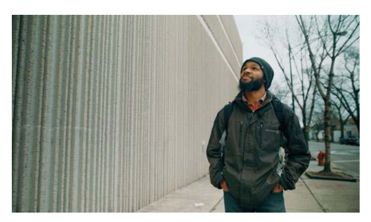
VIDEO "Who Are the Poor?"