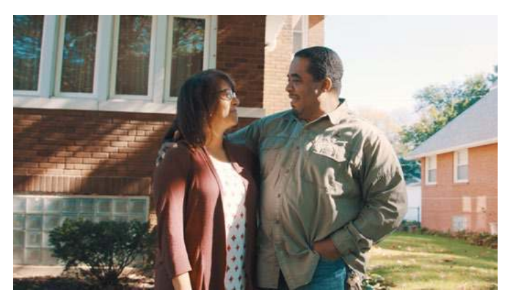
VIDEO "The Scars of Racism"